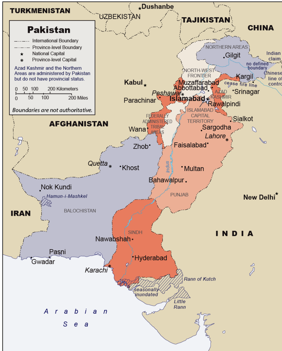
Figure 1. Map of Pakistan