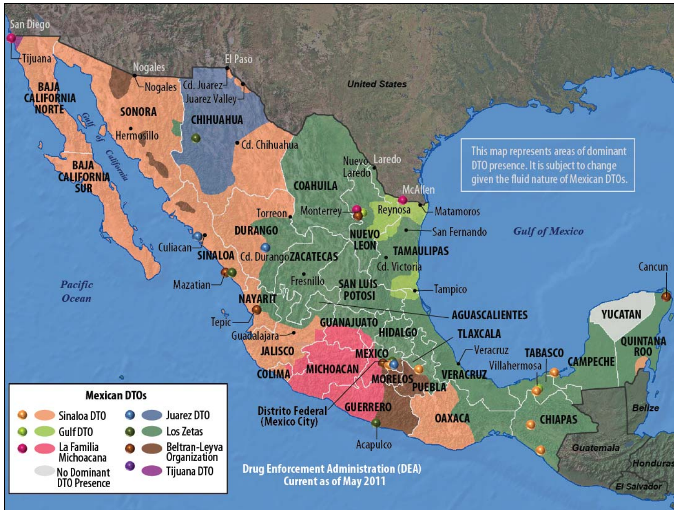
Figure I. Map of DTO Areas of Dominant Influence in Mexico