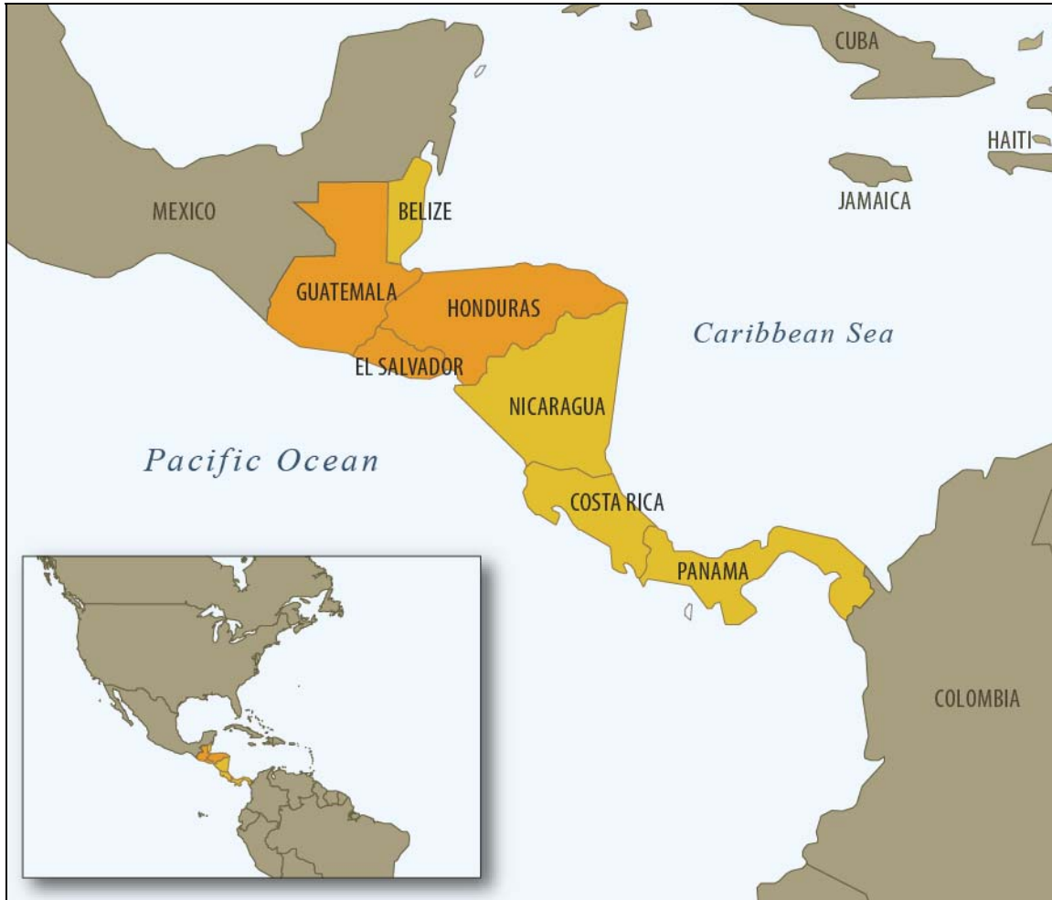
Figure 1. Map of Central America