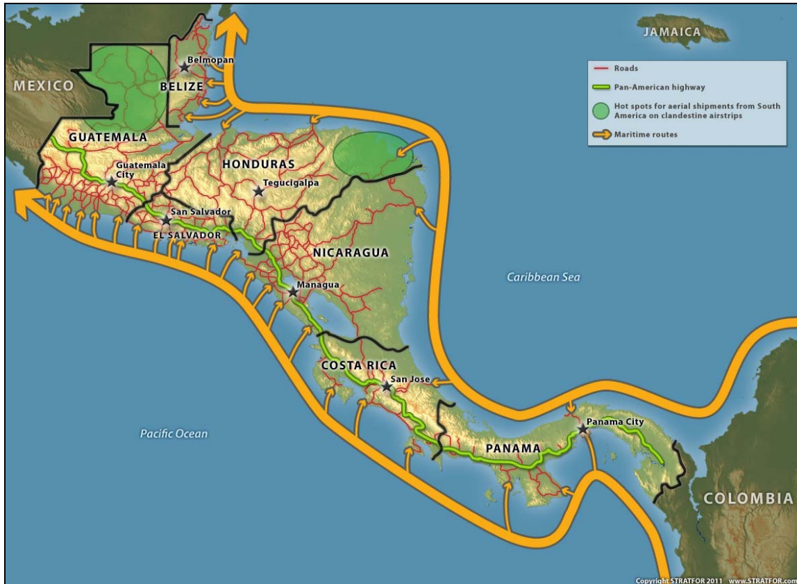
Figure 3. Central American Drug Trafficking Routes