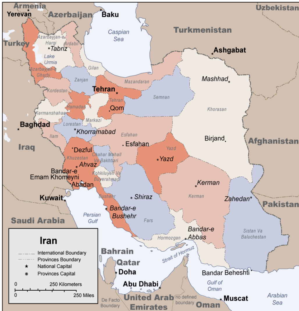
Figure 2. Map of Iran