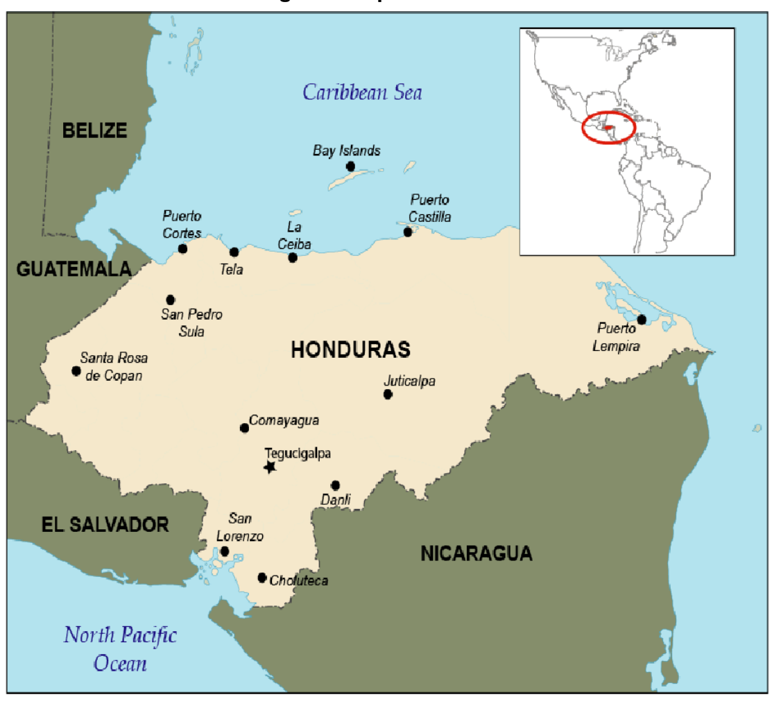
Figure 1. Map of Honduras