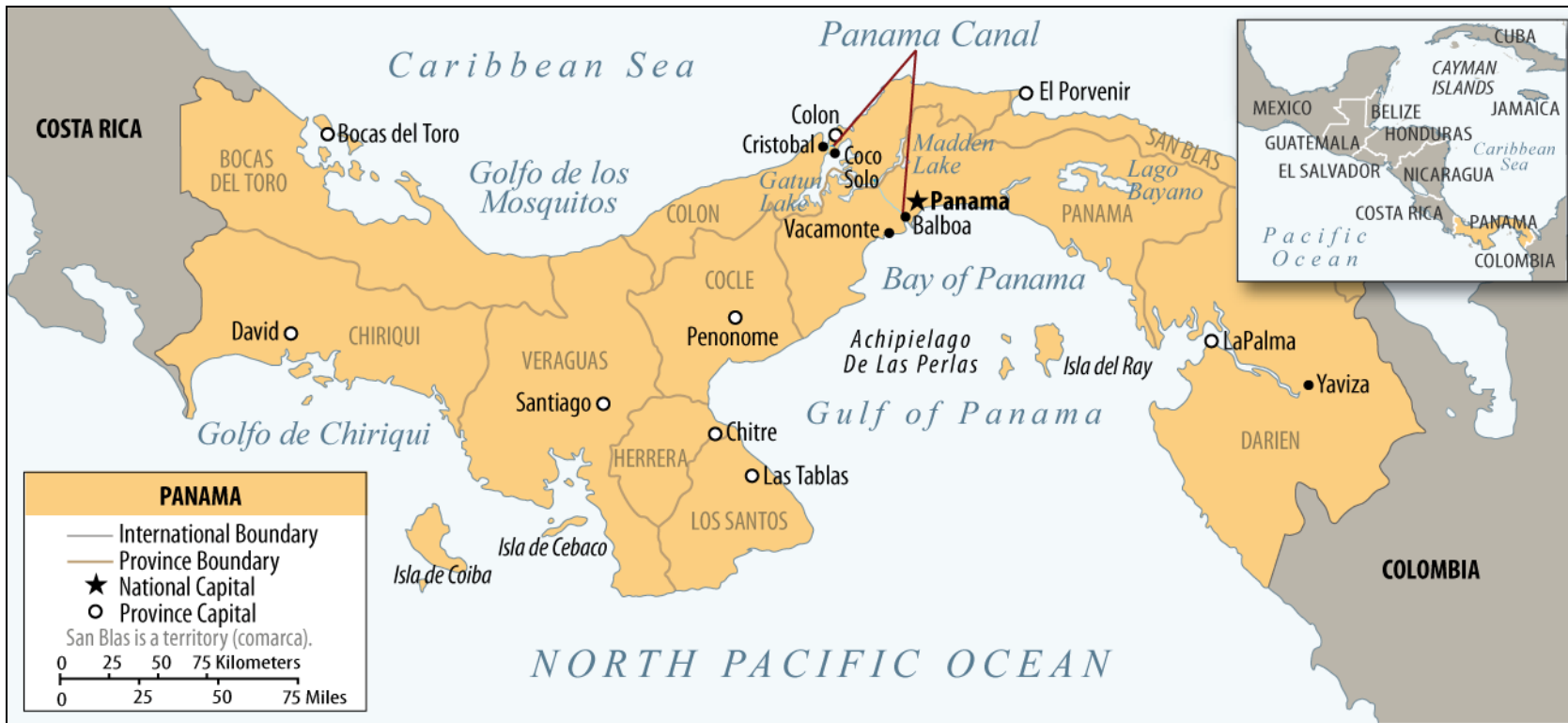
Figure 1. Map of Panama