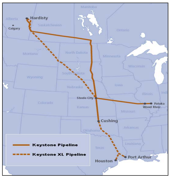
Figure 1.TransCanada Keystone Pipeline System Routes