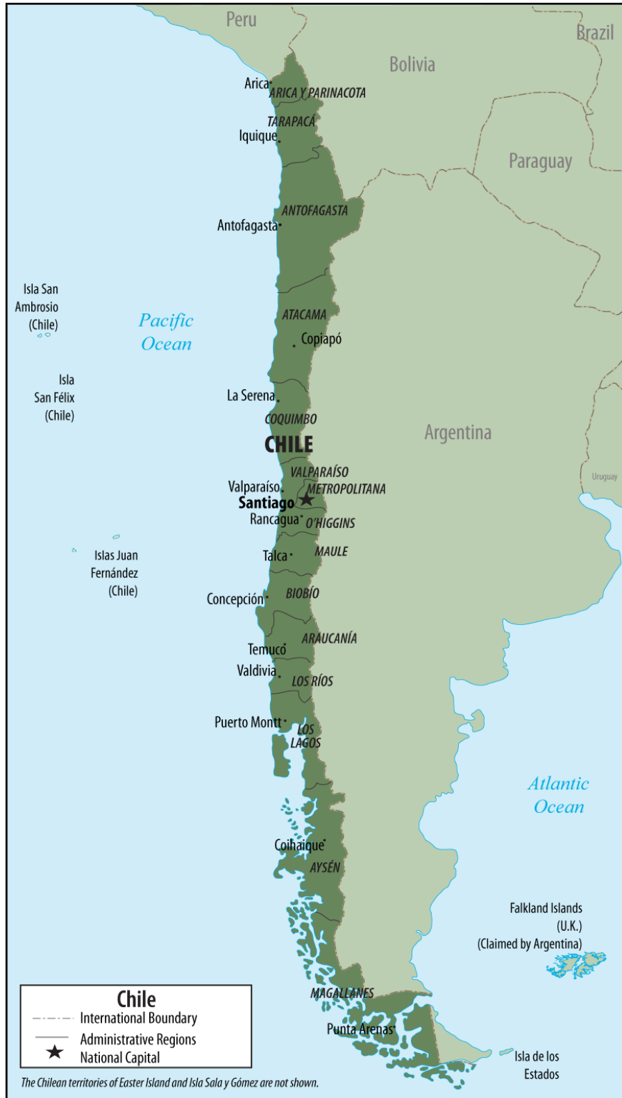
Figure 1. Map of Chile

Source: Map Resources. Adapted by CRS Graphics.