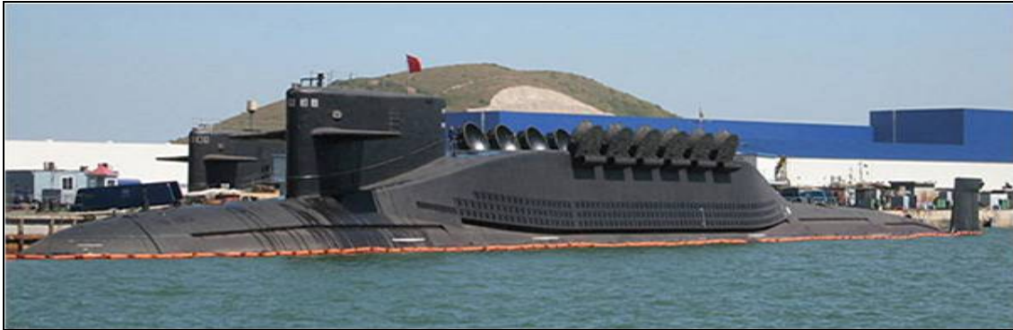
Figure 1. Jin (Type 094) Class Ballistic Missile Submarine