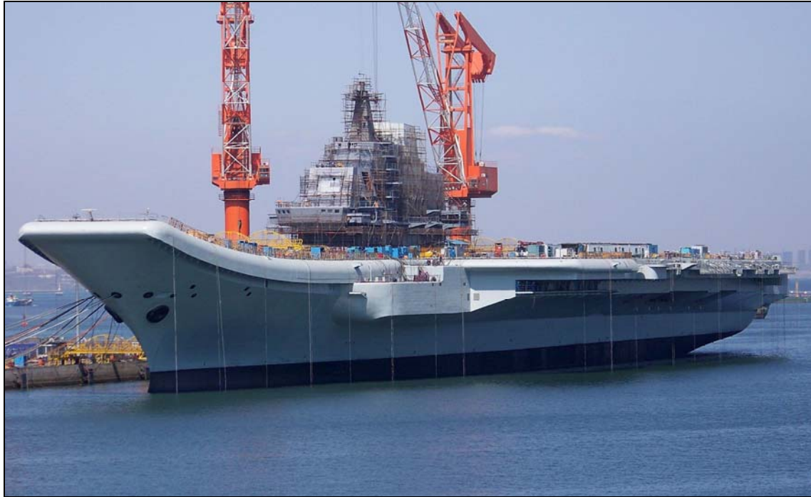
Figure 5. Ex-Ukrainian Carrier Varyag Being Completed at Shipyard in Dalian, China

Source: Photograph provided to CRS by Navy Office of Legislative Affairs, December 2010.