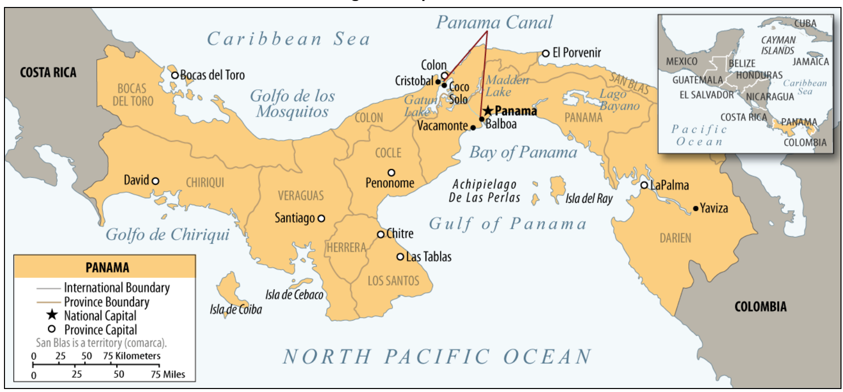
Figure 1. Map of Panama