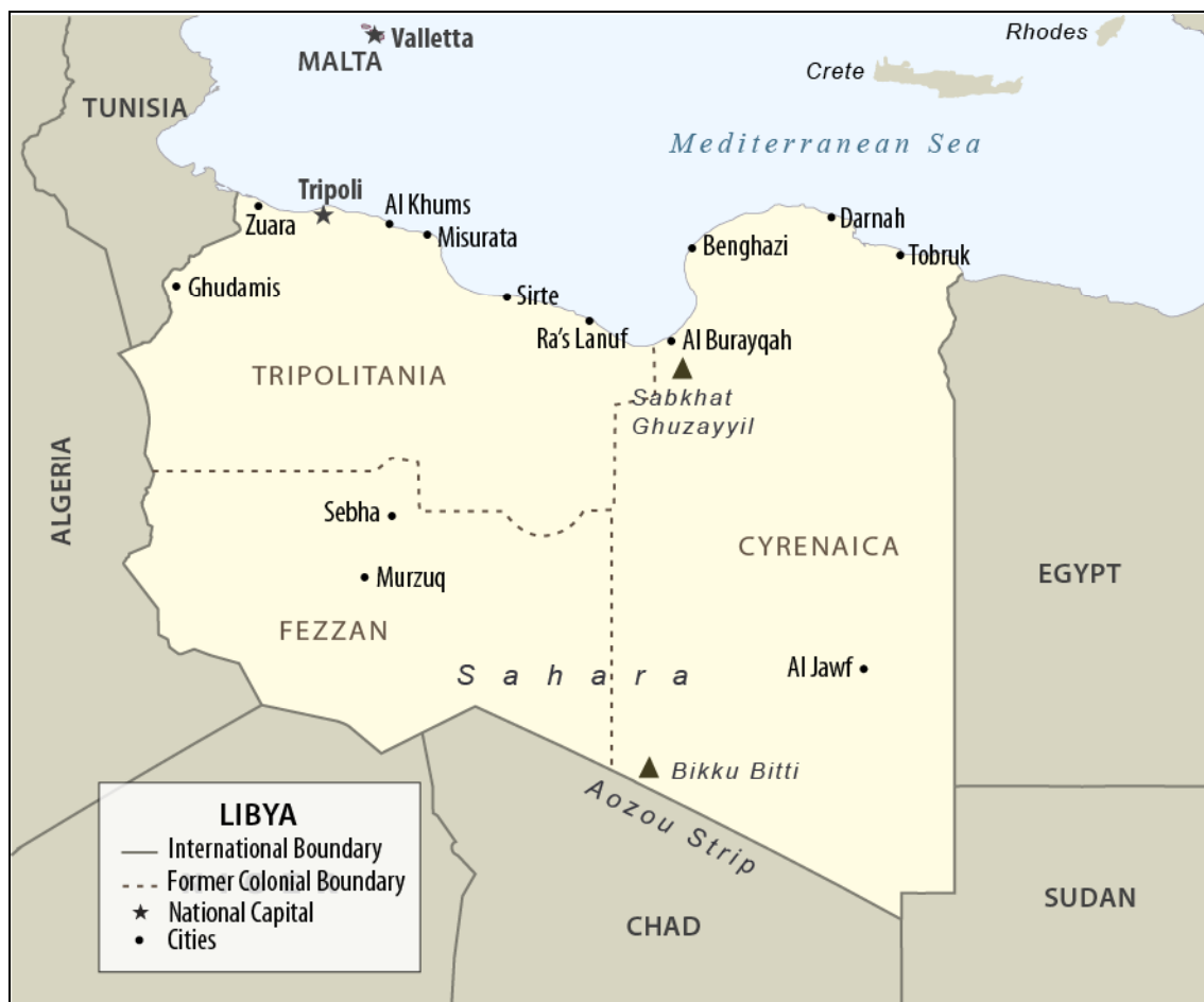
Figure 2. Political Map of Libya

Iraqi insurgency as an indication of ongoing Islamist militancy in Libya and a harbinger of a possible increase in violence associated with fighters returning from Iraq. 78