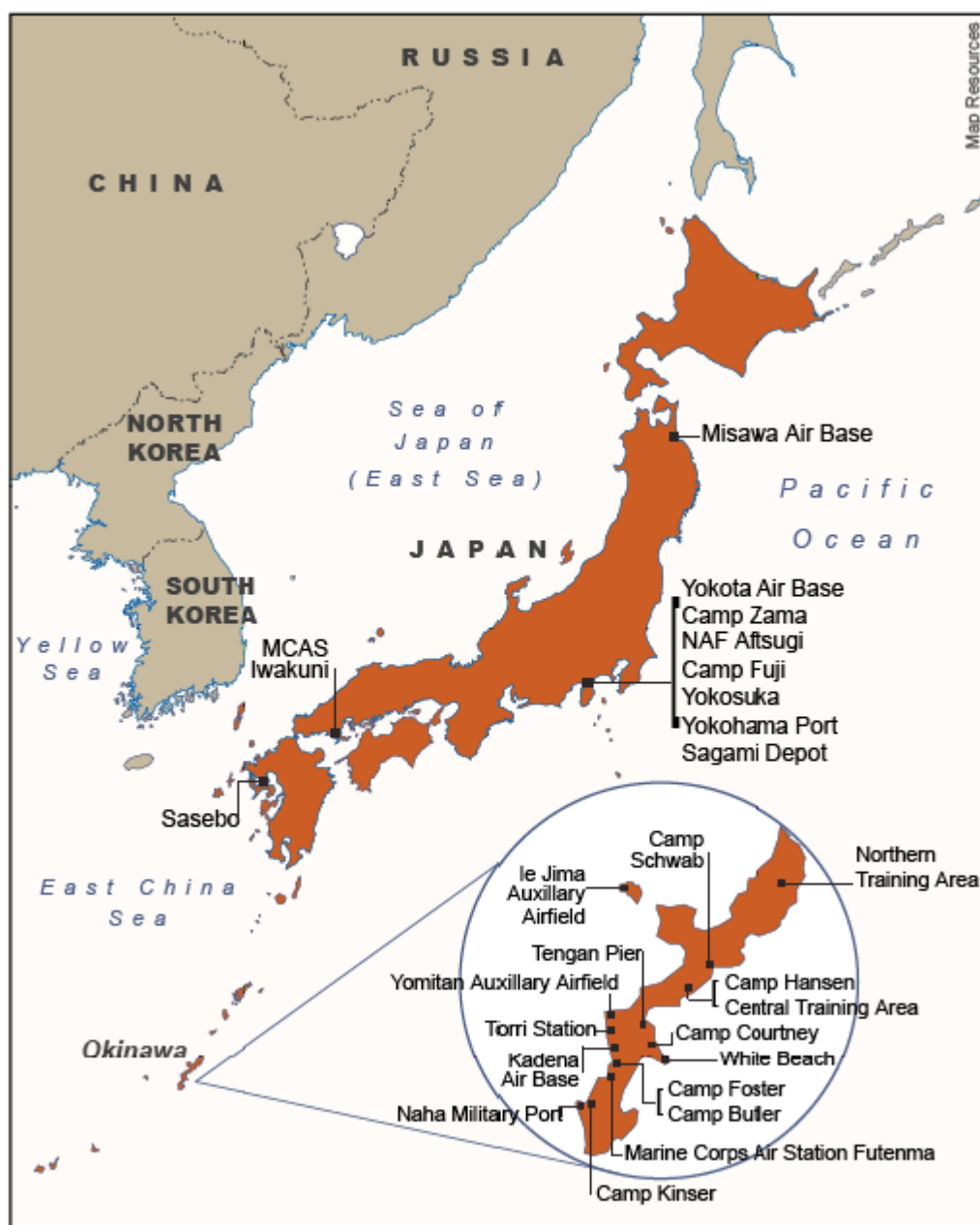
Figure 2. U.S. Bases in Japan