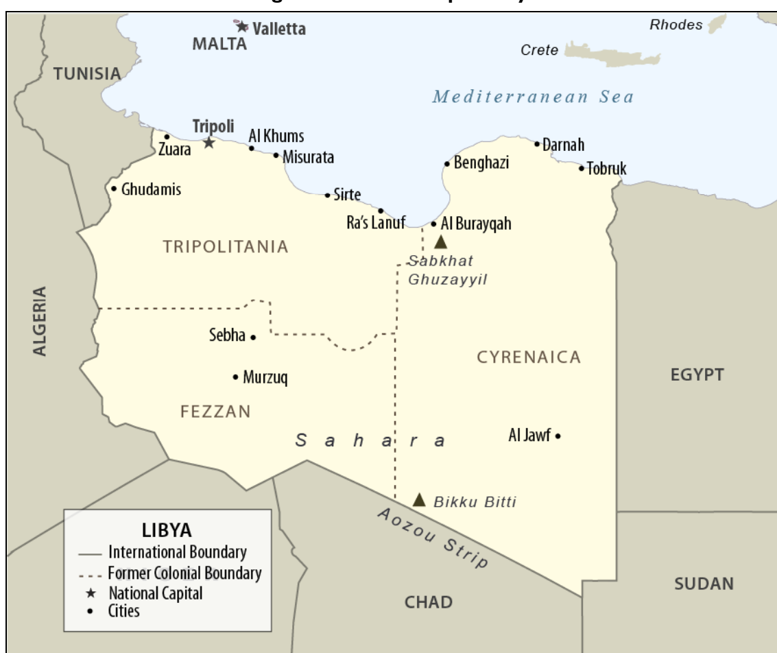
Figure 2. Political Map of Libya

characterized the designations as a U.S. gesture of solidarity with the Libyan government and argued that the ability and willingness of the LIFG to mount terror attacks in Libya may have been limited. Others claimed that some LIFG fighters were allied with other violent Islamist groups operating in the trans-Saharan region, and cited evidence of Libyan fighters joining the Iraqi insurgency as an indication of ongoing Islamist militancy in Libya and a harbinger of a possible increase in violence associated with fighters returning from Iraq. 54 Prior to the 2011 uprising that began in eastern Libya, reports suggested that the region could be a stronghold for LIFG members and other extremist groups that might pose a threat to Libya's security and potentially to regional security. Some Members of Congress have expressed concern that violent Islamists may seek to exploit the conflict in Libya or any post-conflict transition.