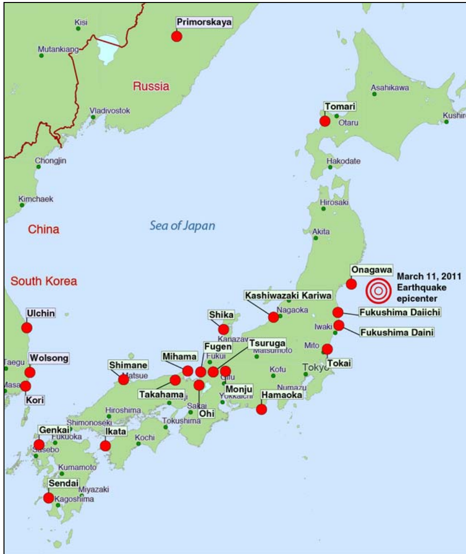
Figure 1. Japan and Earthquake Epicenter