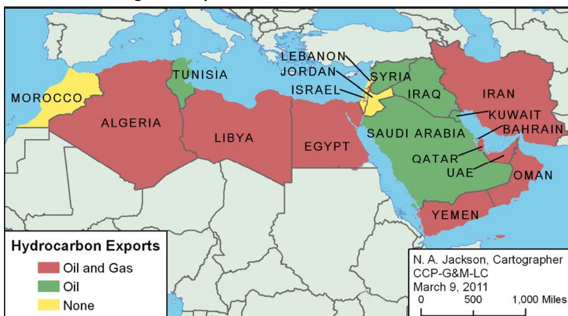
Figure 1. Map of the Middle East and North Africa