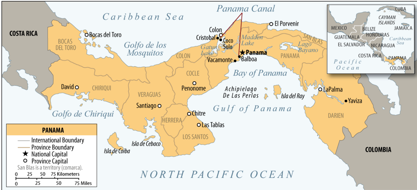
Figure 1. Map of Panama