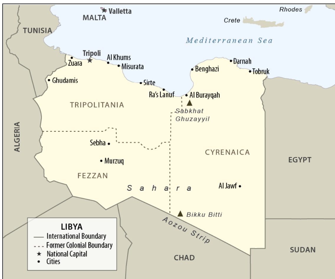
Figure 2. Map of Libya