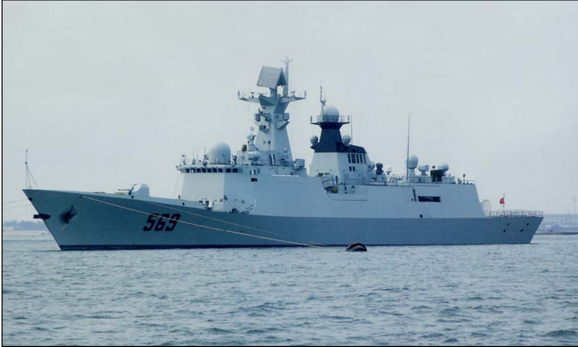
Figure 7. Jiangkai II (Type 054A) Class Frigate