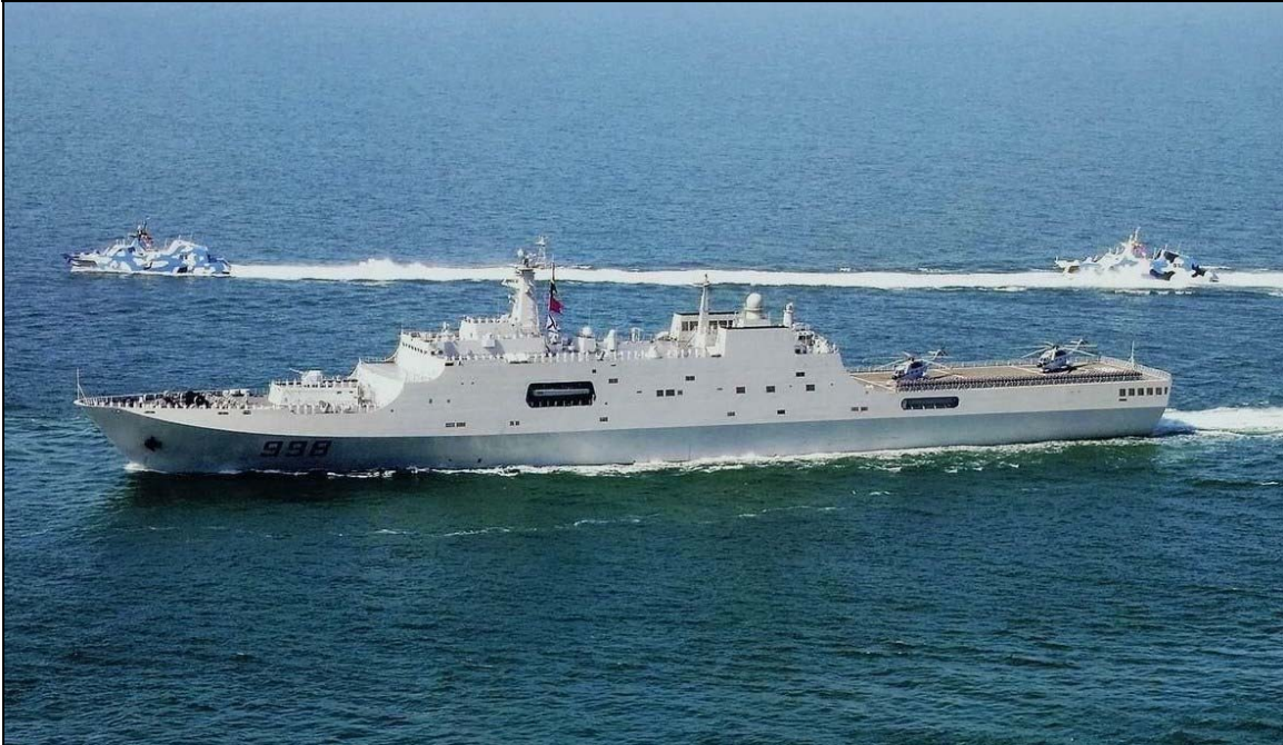
Figure 9. Yuzhao (Type 071) Class Amphibious Ship With two Houbei (Type 022) fast attack craft behind