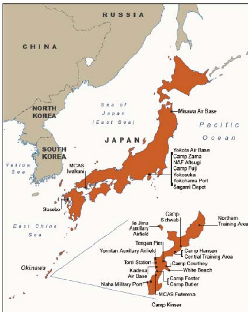
Figure 2. Map of Military Facilities in Japan