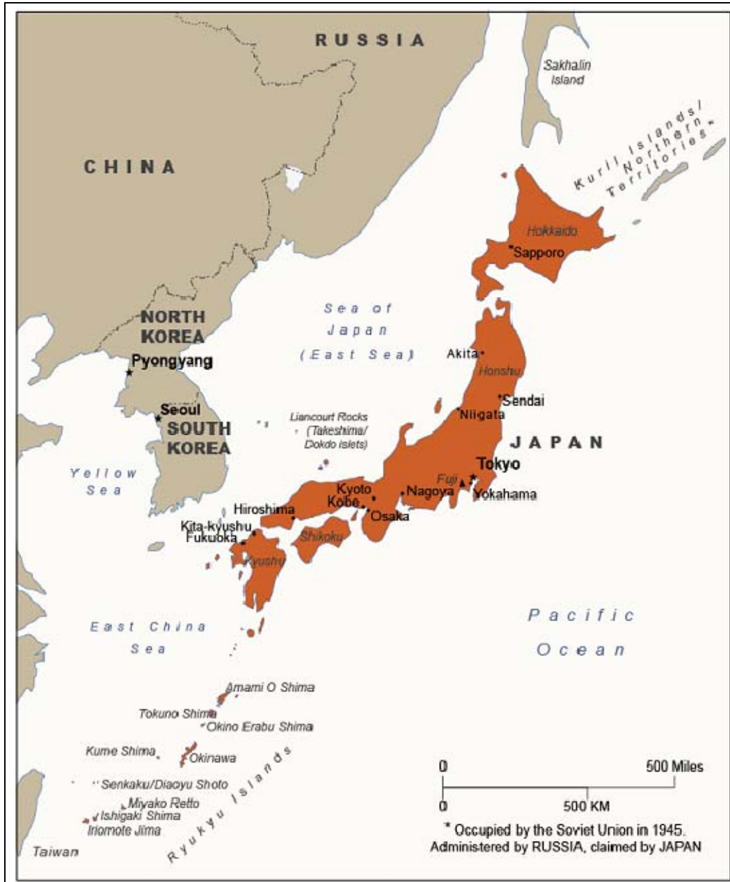
Figure 1. Map of Japan