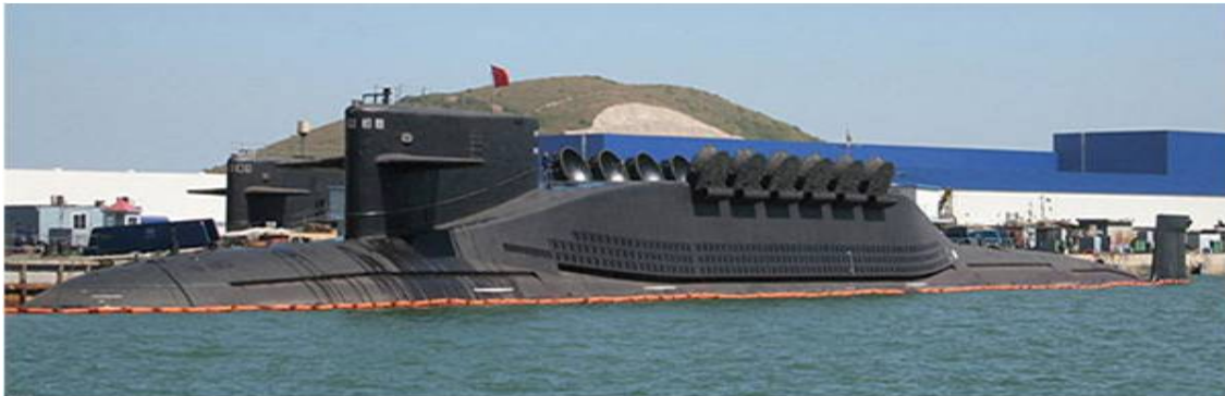
Figure 1. Jin (Type 094) Class Ballistic Missile Submarine