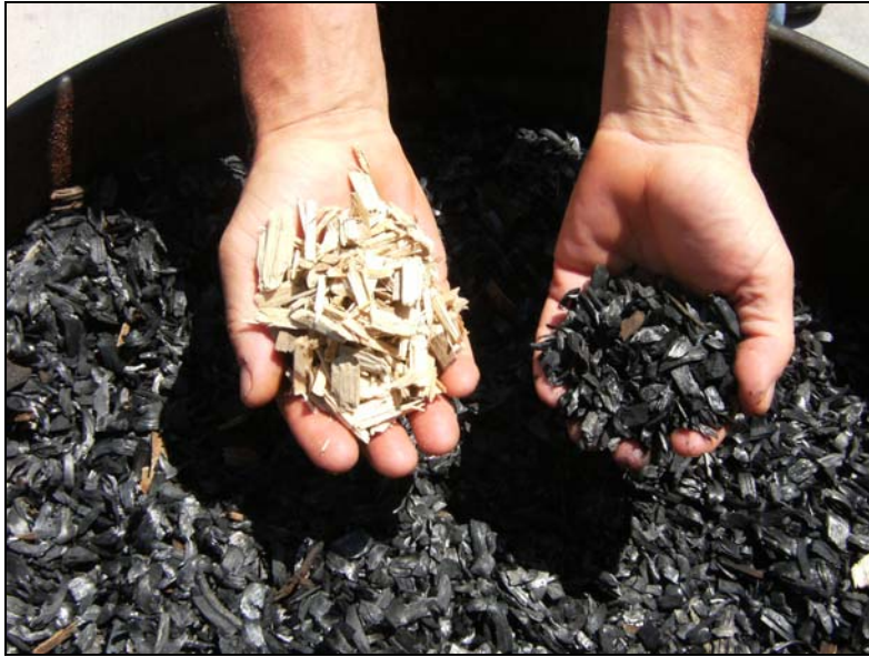
Figure 1. Biochar