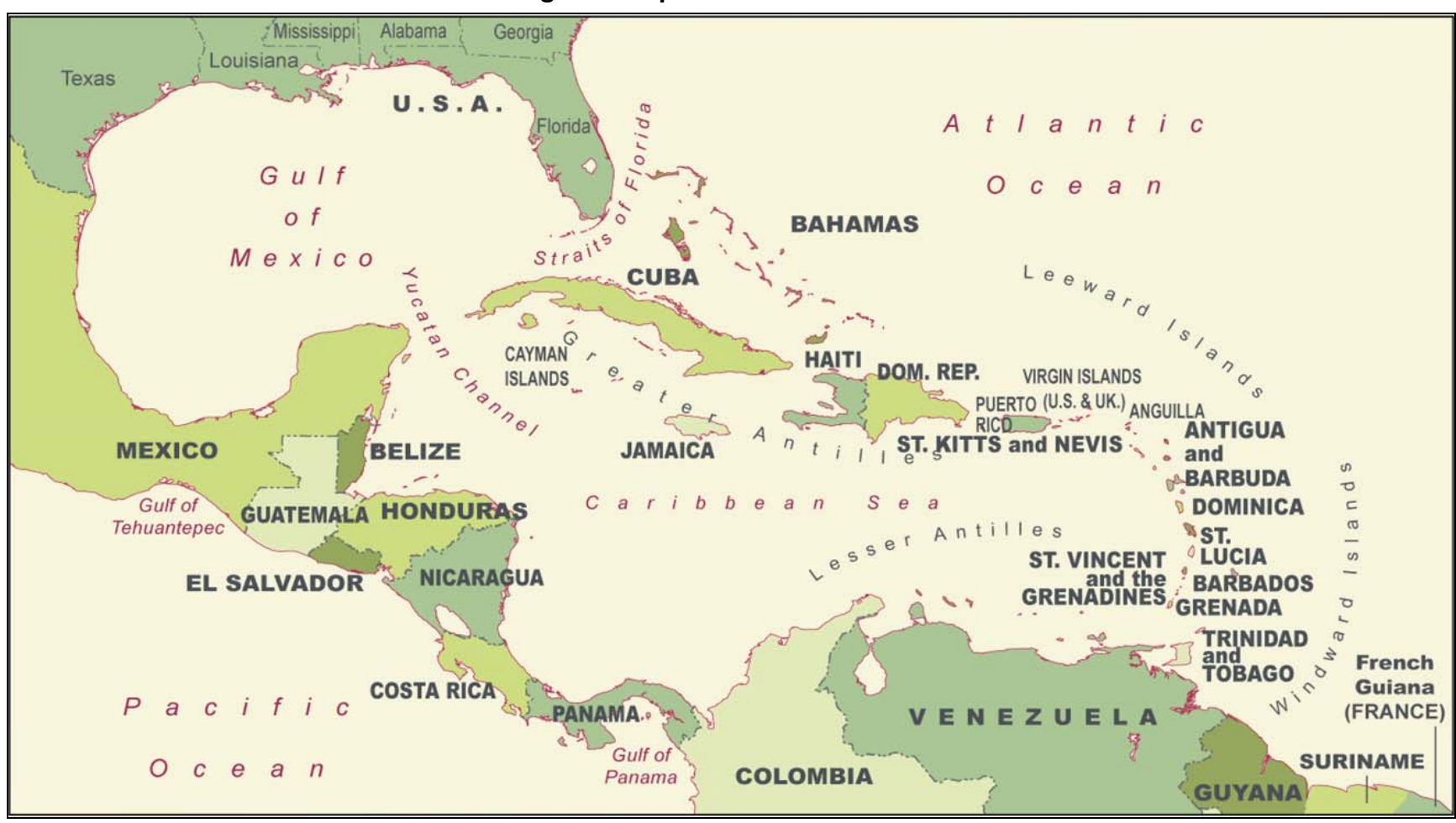
Figure I. Map of the Caribbean Basin