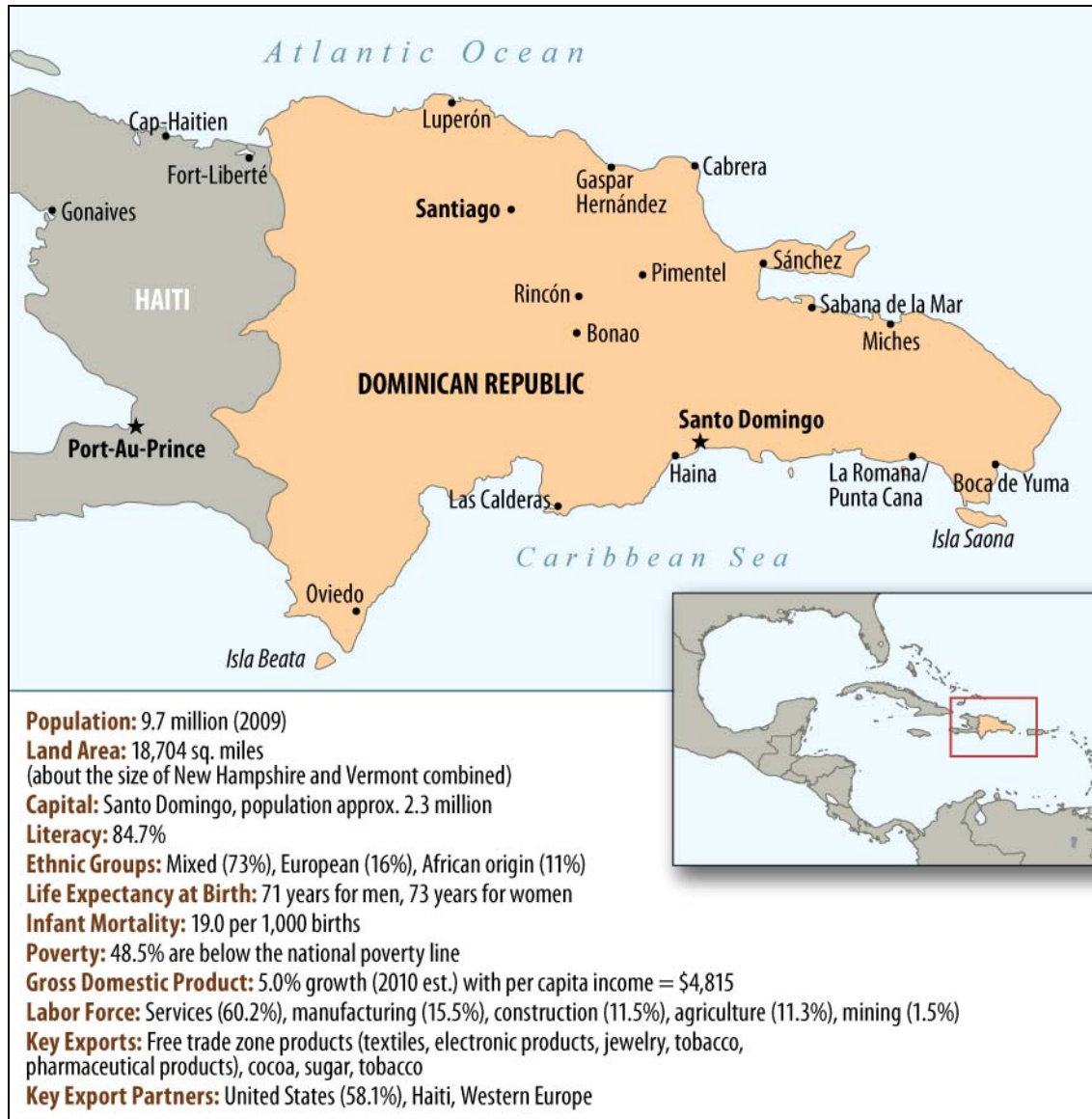
Figure 1. Map of the Dominican Republic and Haiti