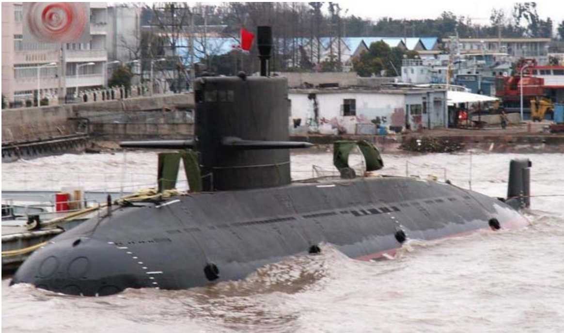
Figure 2. Yuan (Type 041) Class Attack Submarine