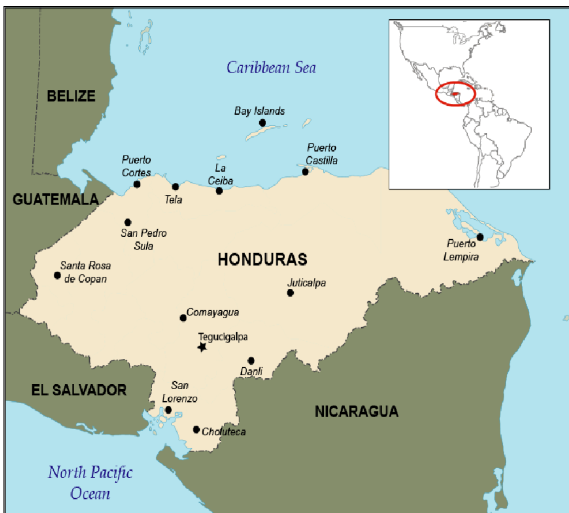
Figure 1. Map of Honduras