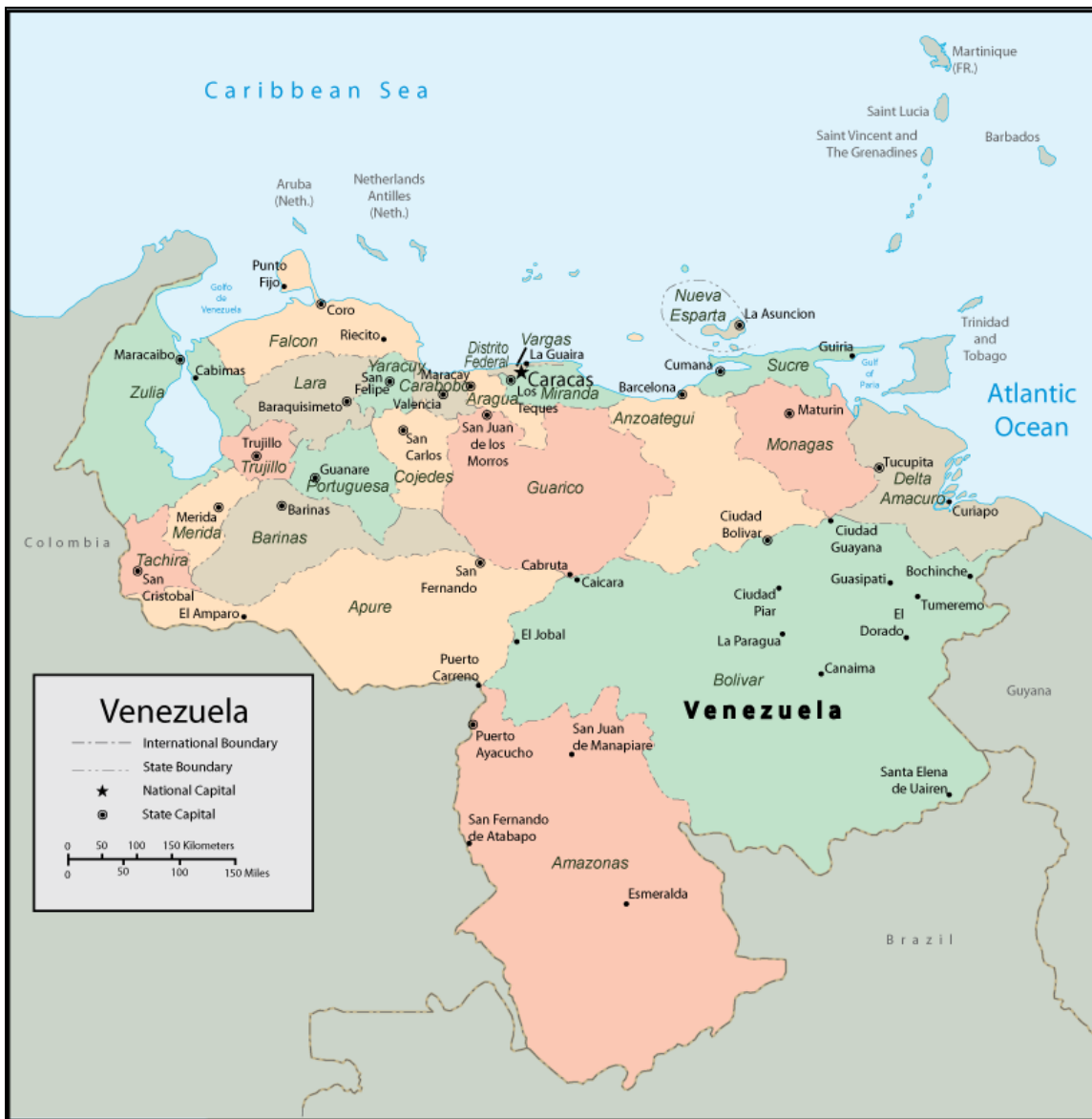
Figure I. Map of Venezuela