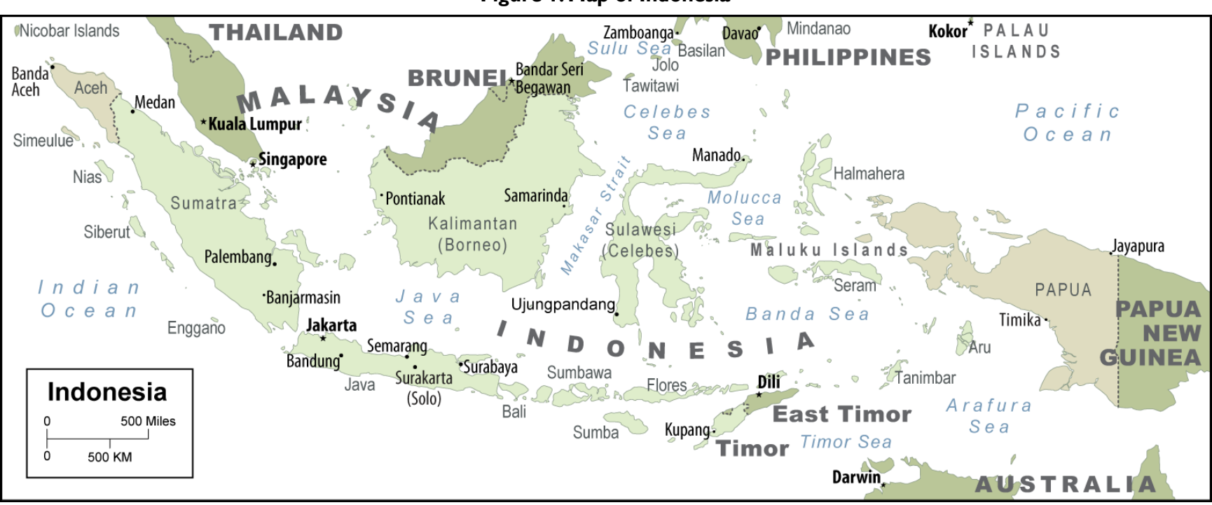
Figure 1. Map of Indonesia