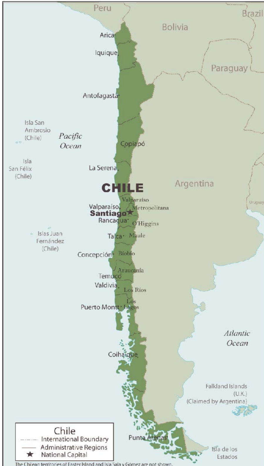
Figure 1. Map of Chile