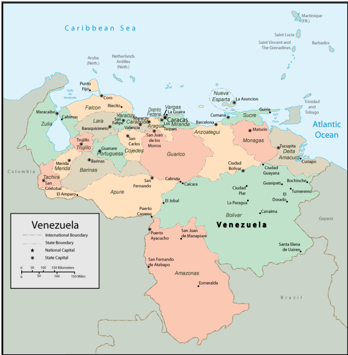
Figure I. Map of Venezuela