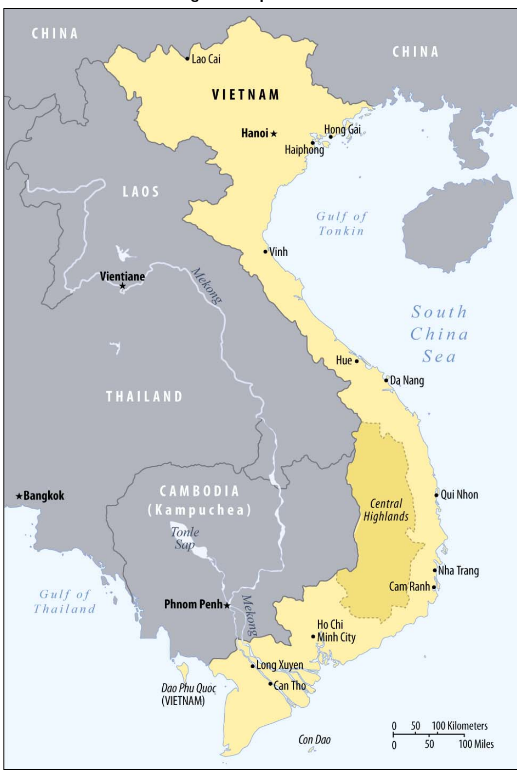
Figure 2. Map of Vietnam