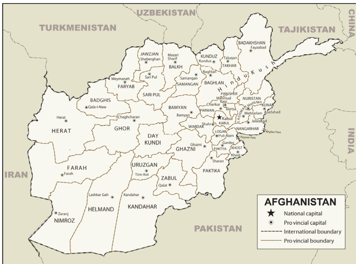
Figure A-1. Map of Afghanistan