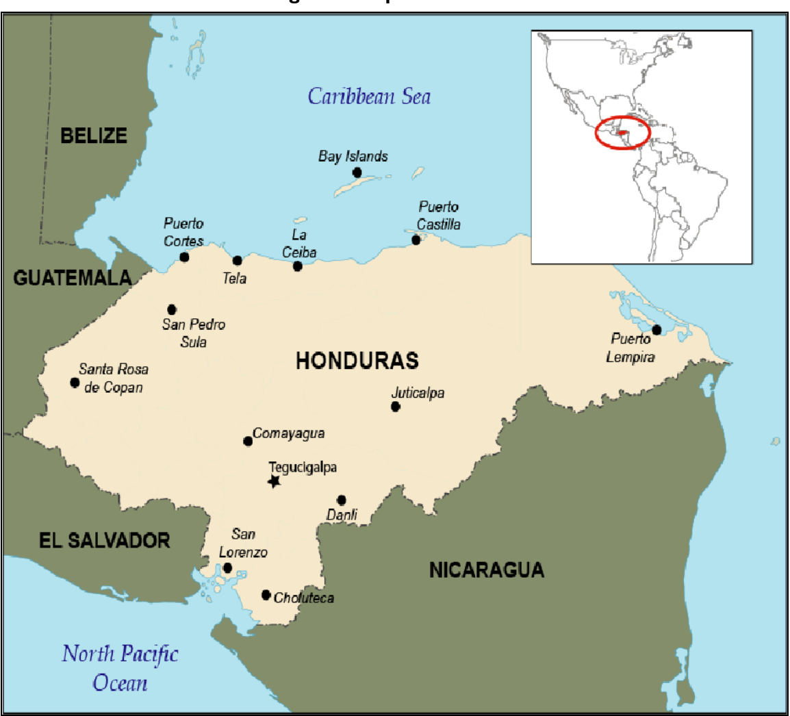
Figure 1. Map of Honduras