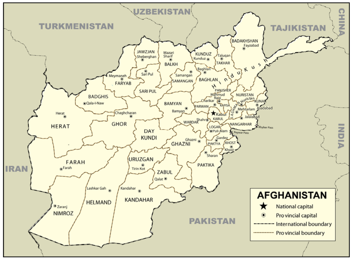
Figure A-I. Map of Afghanistan