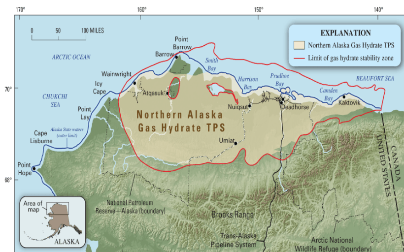
Figure 1. Gas Hydrate Assessment Area, North Slope, Alaska