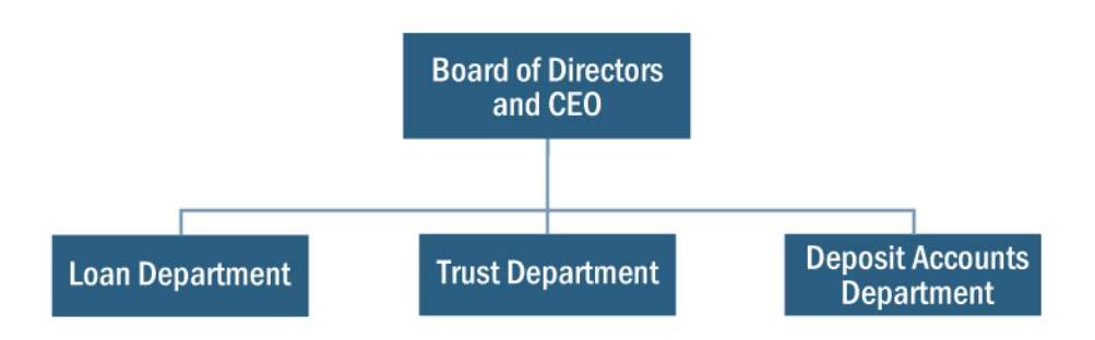
Figure A-2. National Bank and Subsidiaries