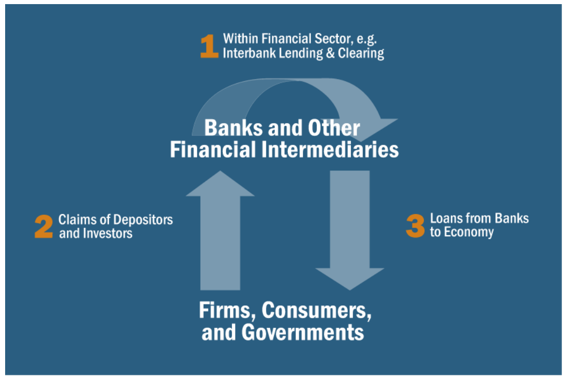
Figure I. Where Financial Disruptions Arise