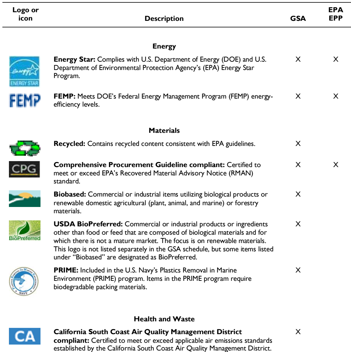
Table 3. Types of Green Products Listed in GSA and EPA’s EPP Databases by Primary Focus

Table 3 lists the kinds of green product and service certifications and labels available through the GSA online catalog or schedule and EPA’s EPP database. As the table shows, there are more than 20 designations altogether in the two databases, covering several green factors. Both databases contain integrative or multiattribute labels, but most labels focus on only one or two attributes. Most designations refer to specific standards by various agencies and organizations, but the GSA schedule contains four that are more general: Recycled, Biobased, Non-Toxic, and Environmentally Friendly. Unlike the GSA catalog, the EPA database does not list product choices directly but provides electronic links to separate lists, including the GSA schedule.