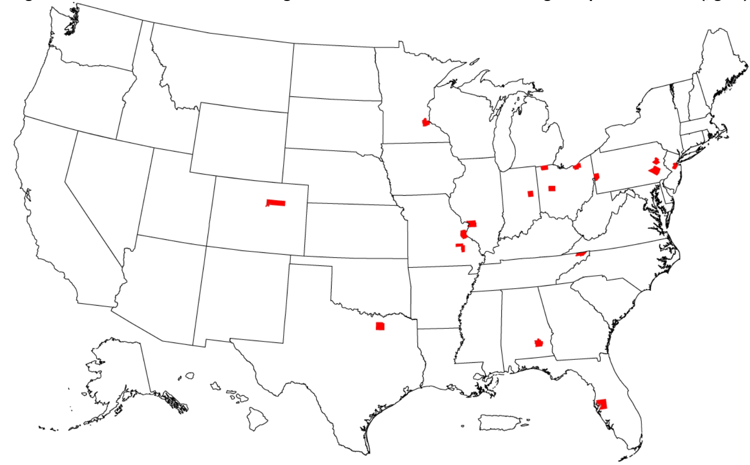
Figure 1. Counties with Monitors Violating the 2008 Lead Standard of 0.15 micrograms per cubic meter (µg/m³)