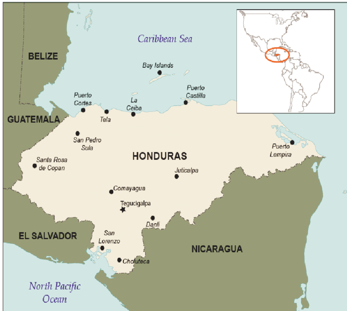
Figure 2. Map of Honduras