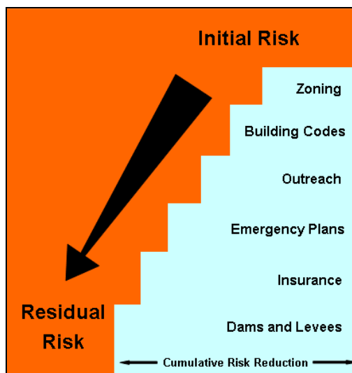
Figure 2. Multiple Tools Available To Reduce Flood Risk