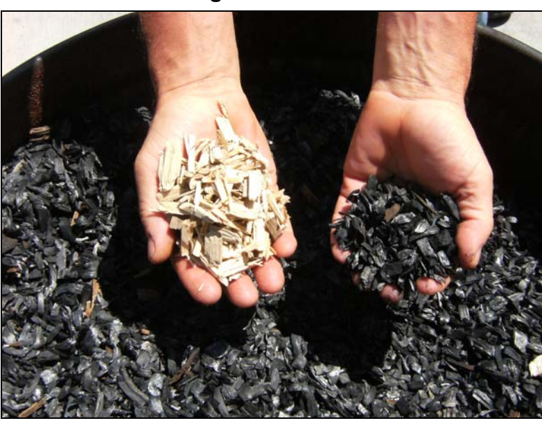
Figure I. Biochar