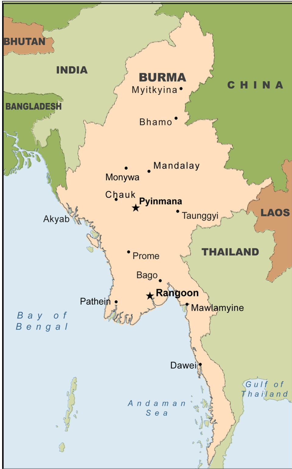
Figure 2. Map of Burma