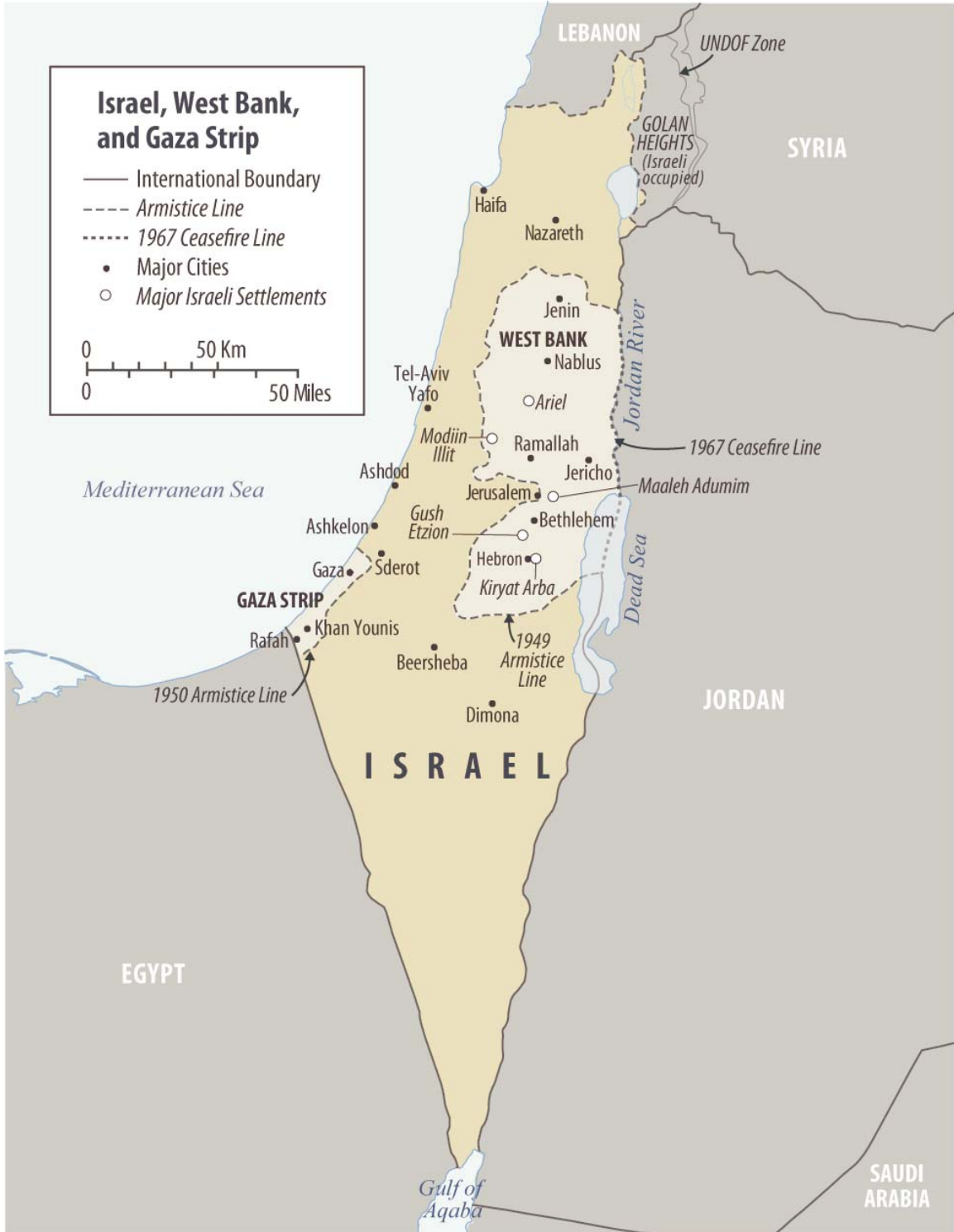
Figure 1. Map of Israel, the West Bank, and the Gaza Strip