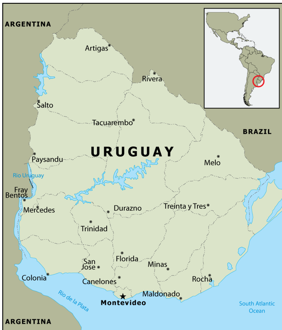
Figure 1. Map of Uruguay