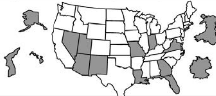
13 States and 3 Countries Affected in FY10

Total Savings: $351M FY10 ($3.5B FYDP) ~4K AD end strength