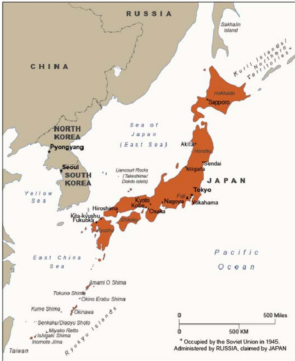
Figure 2. Map of Japan