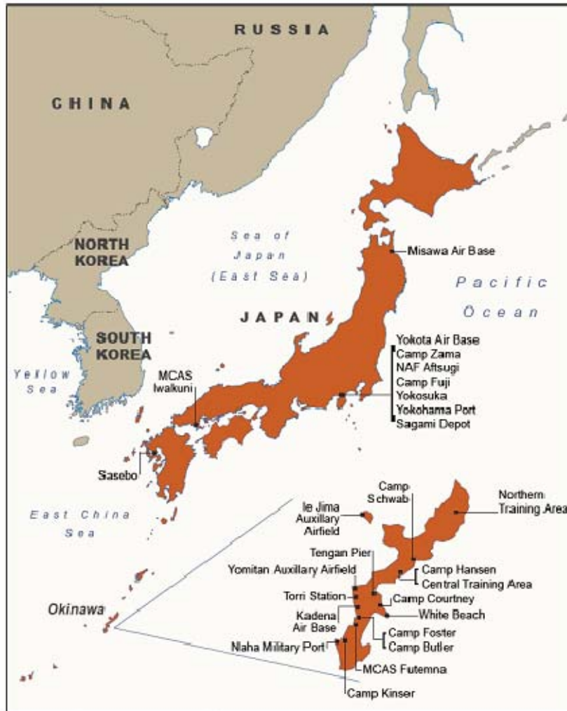
Figure 3. Map of Military Facilities in Japan

A U.S.-Japan program of cooperative research and development of anti-ballistic missiles began in 1999. The decision to acquire the ground-based U.S. Patriot Advanced Capability-3 (PAC-3) system and the ship-based U.S. Standard Missile-3 system was justified largely on the basis of North Korea's missile program. In December 2005, Japan's Defense Agency agreed that Japan will pay over $1 billion for the project over nine years. Following North Korean missile tests in July 2006, officials announced that the deployment of the PAC-3 system to Okinawa would accelerate. In December 2007, a Japanese destroyer successfully intercepted a missile in a test exercise near Hawaii. Japan mobilized its land and sea-based missile defense systems for the first time in response to North Korean missile tests in April 2009.