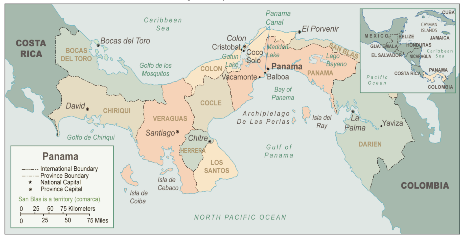
Figure I. Map of Panama