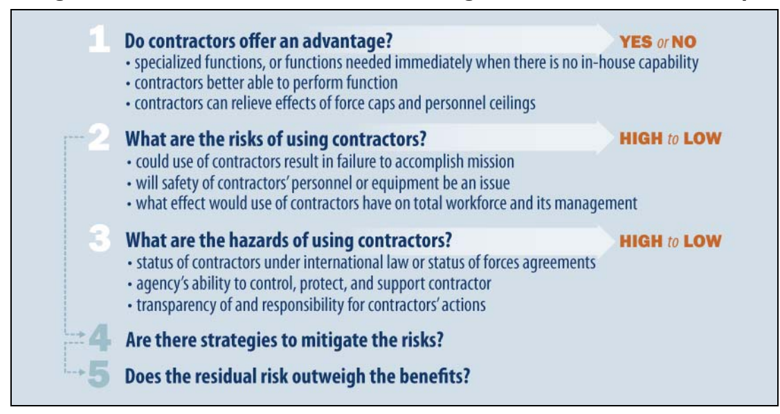
Figure 5.A Possible Framework for Addressing Questions of Contract Policy