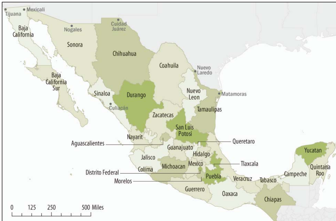
Figure 2. Map of Mexico