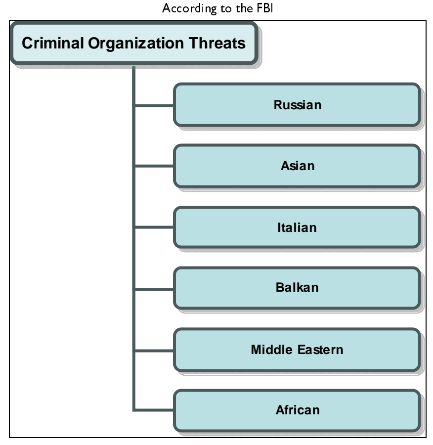
Figure 3. Organized Crime Threats in the United States

Although organized crime is popularly associated with the Italian Mafia, the breadth of organized crime in the United States includes many other criminal organizations. The FBI investigates organized crime groups that fall into three major categories: (1) La Cosa Nostra, Italian organized crime, and racketeering; (2) Eurasian/Middle Eastern organized crime; and (3) Asian and African criminal enterprises. Figure 3 outlines the top organized crime threats to the United States, as identified by the FBI. Threats to the United States posed by selected large-scale criminal organizations are discussed below.