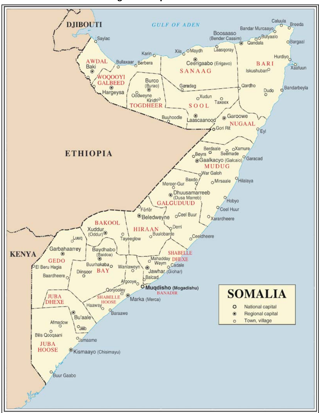
Figure 2. Map of Somalia